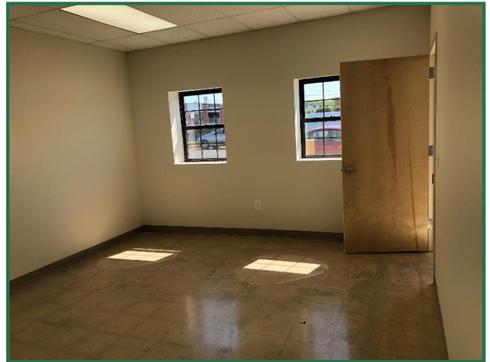
Unit A Office #2

For further information, please contact: