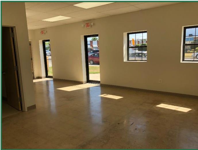
Unit A Office #1

Unit C – 3,510 SF Office Size: 22' x 18'